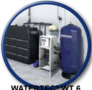
WATERTEC® WT 6