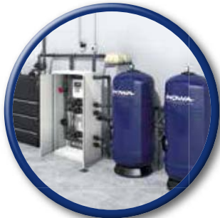
WATERTEC® WT 20