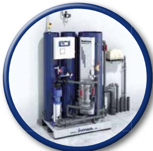
WATERTEC® WT 3 K